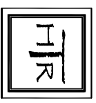
HOT TIN ROOF Custom Home Design