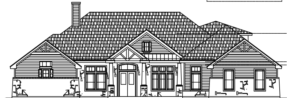
FRONT ELEVATION SCALE: 1/4" = 1'-0"